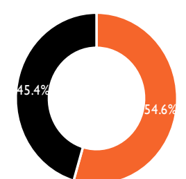
■ Foreign Investors ■ Domestic Investors