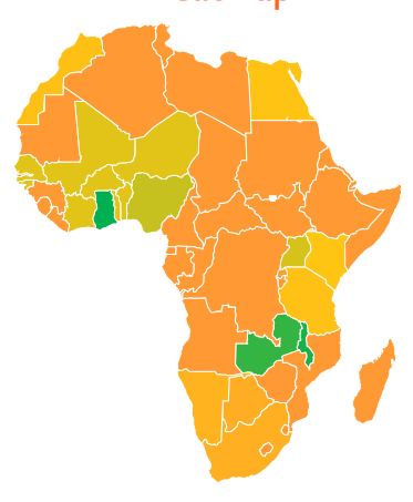
Powered by Bing © GeoNames, Microsoft, OpenStreetMap, TomTom