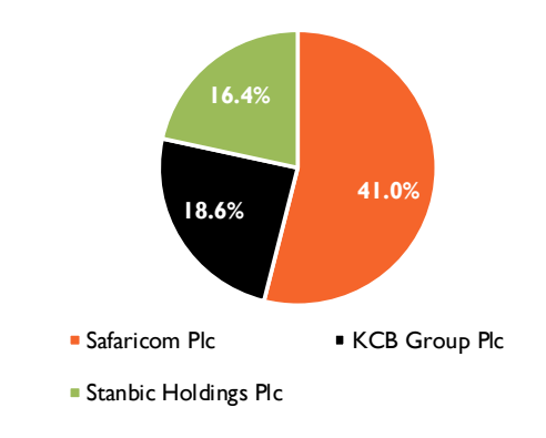
Top 3 Traded Counters